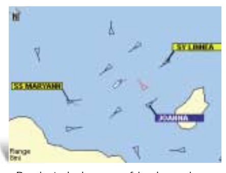
Be alerted when your friends are in the same area.