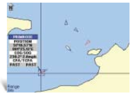
Move the cursor over a target to identify the vessel.