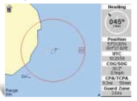
A guard zone with alarm.