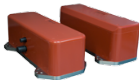
Transducer array (Rx/Tx)