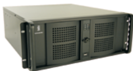
Hydrographic Work Station (HWS)