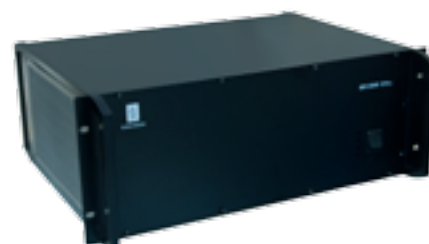
Processing Unit (PU)